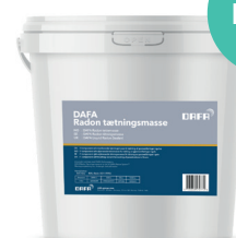
New, larger size! DAFA liquid Radon, 5 l. bucket.