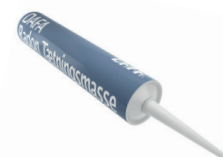
DAFA liquid Radon sealant, 300 ml. tube