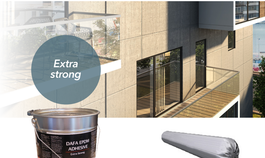
DAFA EPDM High Tack adhesive 5 liter