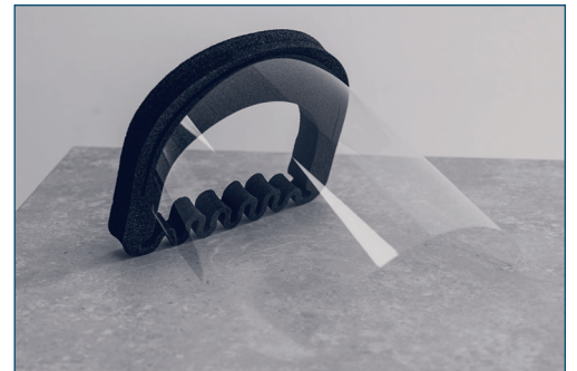
DAFA Face Shield.

For more information please contact us. Click here