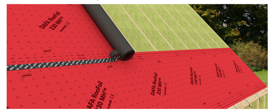
DAFA RooFoil 230 MH Plus is installed with an overlap of minimum 150 mm. Self-adhesive borders in both sides ensure optimal adhesion.