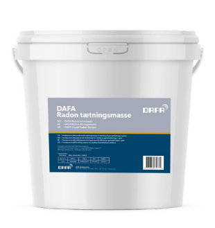
DAFA Radon Sealing mass (310 ml. og 5 l.) and DAFA Radon flexible molding.